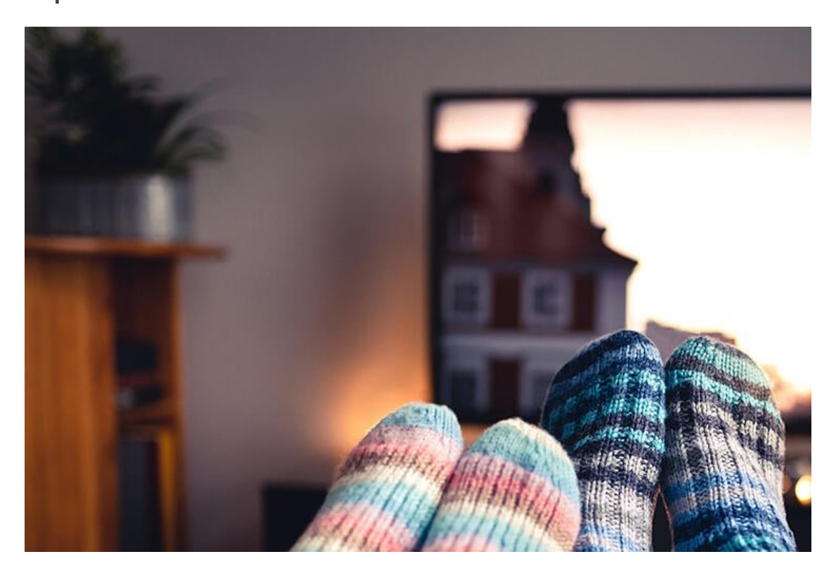
Capital's Favorite Movies to Watch this Fall

It was a long summer, but now the kids are back in school, the leaves are changing, and the Georgia Bulldogs are rolling. We have swapped the summer reading books out to create a fall movie list of some of our team's favorites. So get the popcorn poppin' because we've got some great ones.